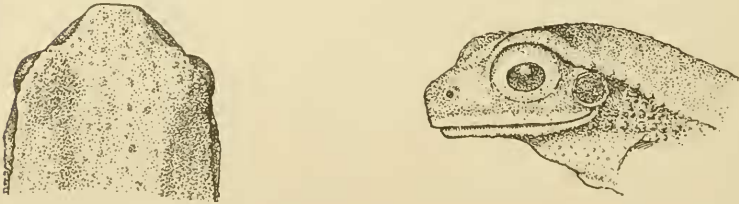
FIG. 4.—Head of Chirixalus simus , sp. nov., \times 3 .

Type .—No. 17971: Rept. Ind. Mus. : an unique specimen.